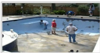
TILES GAP FILLING